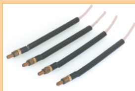
Alternative threaded connection adapters «flexi-rigid» type with flexible tube within rigid but nonetheless flexible guide tubes : Order ref. «M5ADPFR» for M5 female threaded connection points. Order ref. «M6ADPFR» for M6 female threaded connection points.