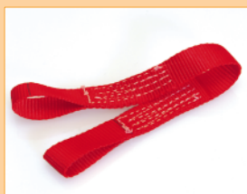
Suspension strap (A tough webbing strap with two end loops for easy suspension from workshop stands) : Order reference : «IMSTRAP».