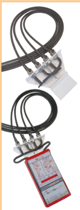
Adapter kit for use on 4-cylinder engines with 4 carbs Order reference : «SM2-4CHAD»