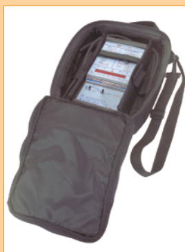
Tough, double wall woven fabric, two way zipper carrying case. Order reference : «IMCASE»

Order reference «SM2KIT», includes battery cord-set, rubber holder, 4 metal connection adapters (2 x M5, 2 x M6), T-connector and instructions. Delivered in carton box.