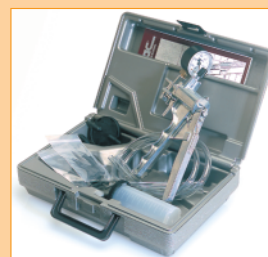
MityVac hand vacuum pump kit (see «special note 2 overleaf») : Die-cast metal hand vacuum pump with manometer to 1000 bars, storage jar, connection adapters. This kit has many other automotive uses. Documentation available. Order reference «MV4000».