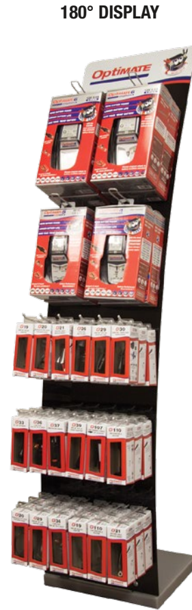
FLOOR DISPLAYS For Optimate 1 through 6 & Accessories